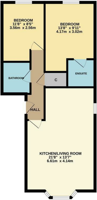
TOTAL FLOOR AREA : 595 sq.ft. (55.2 sq.m.) approx.

Whilst every attempt has been made to ensure the accuracy of the floorplan contained here, measurements of doors, windows, rooms and any other items are approximate and no responsibility is taken for any error, omission or mis-statement. This plan is for illustrative purposes only and should be used as such by any prospective purchaser. The services, systems and appliances shown have not been tested and no guarantee as to their operability or efficiency can be given. Made with Metropix ©2025